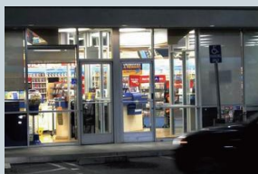
Network Gun Camera