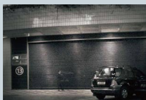
Color Waterproof IR Camera(Medium/Long Distance)